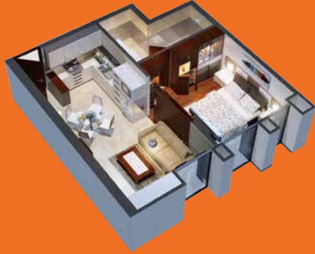
TYPE 1 UNIT PLAN 820 sq.ft.