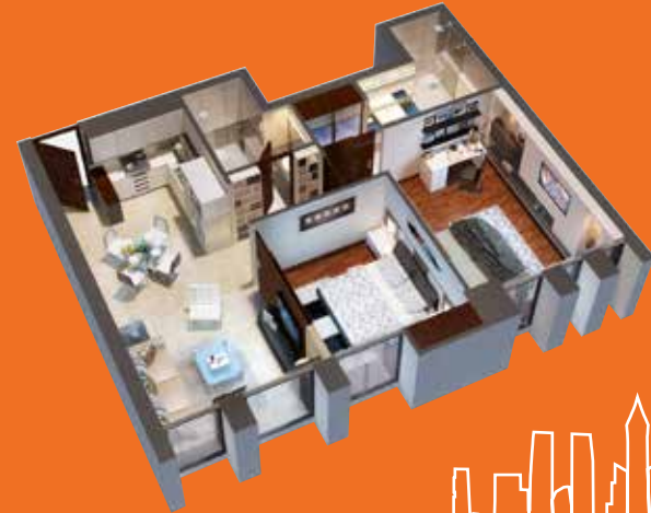
TYPE 2 UNIT PLAN 1085/1155 sq.ft.