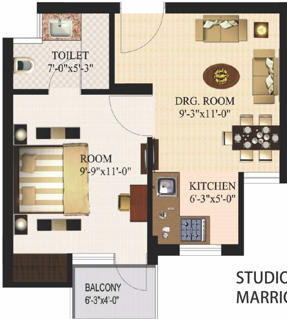
STUDIO APARTMENT MARRIOT 500.00 SQ.FT.