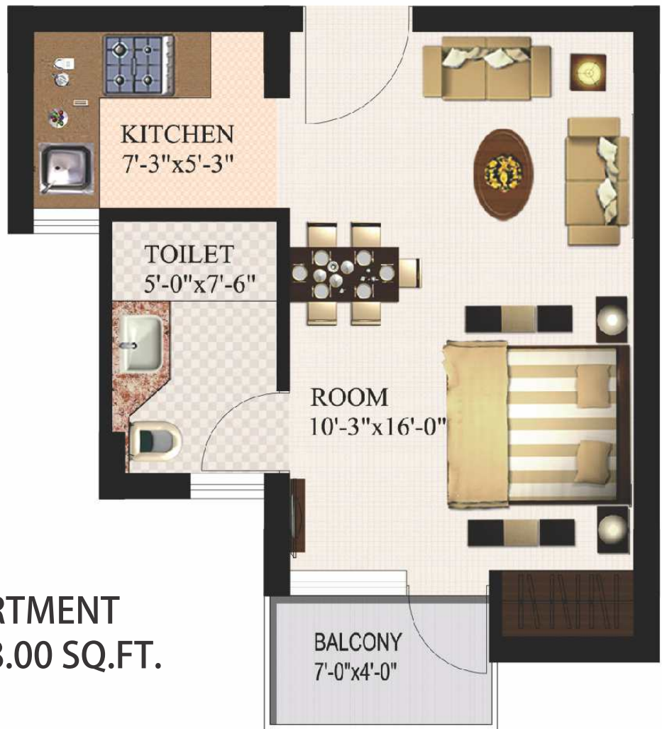
STUDIO APARTMENT MARRIOT 408.00 SQ.FT.