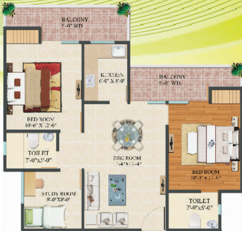
2 BEDROOM + 2 TOILET + STUDY Super Area - 1135 Sq. Ft.