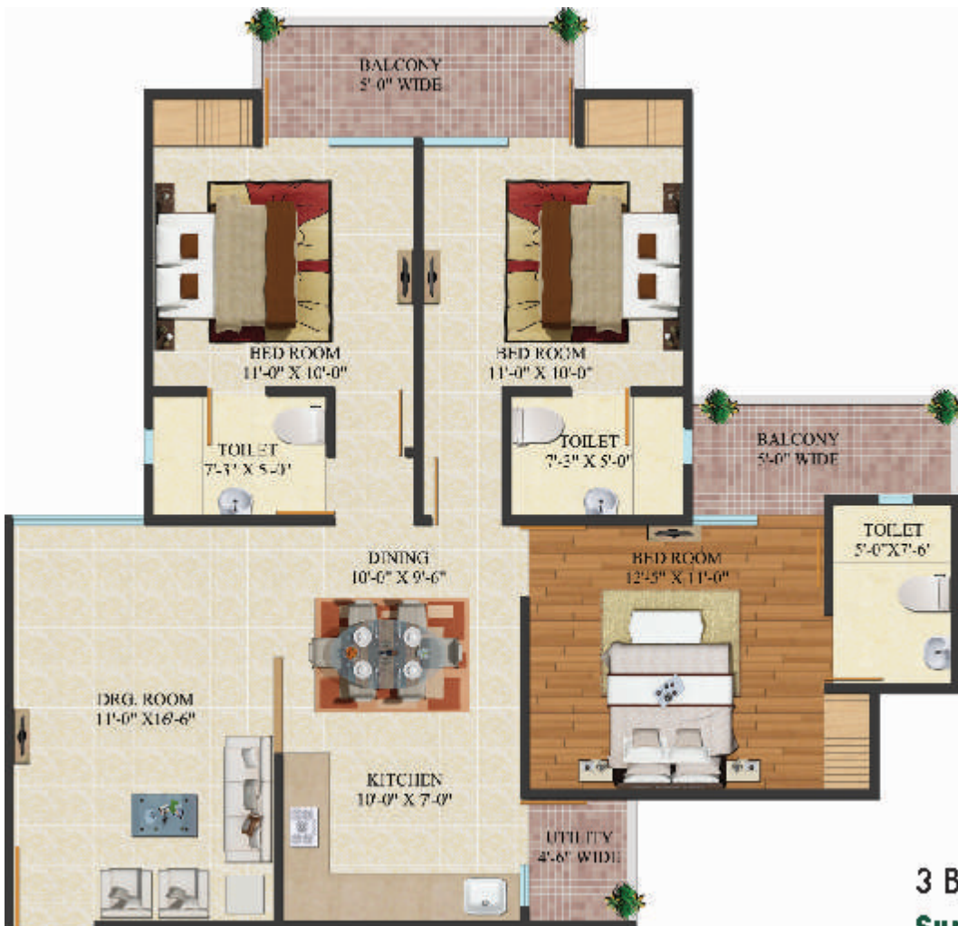
3 BEDROOM + 3 TOILET Super Area - 1440 Sq. Ft.