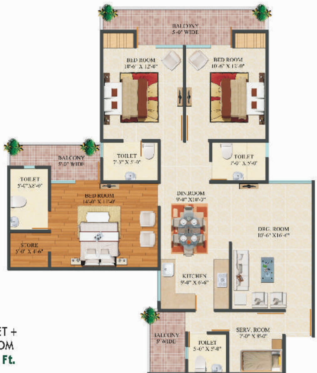
3 BEDROOM + 4 TOILET + STORE + SERVANT ROOM Super Area - 1665 Sq. Ft.