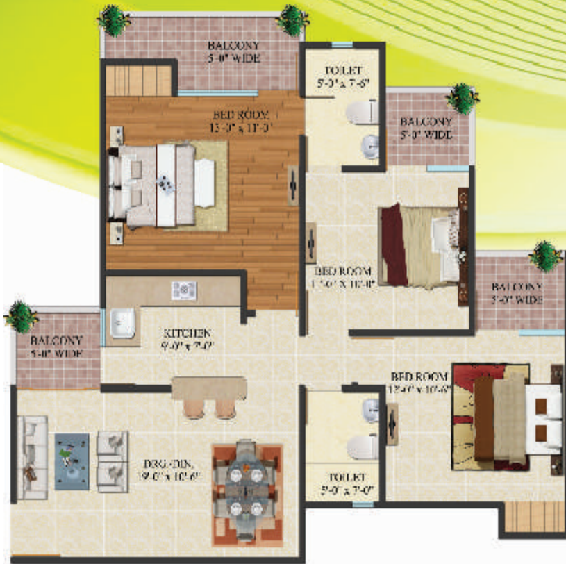
3 BEDROOM + 2 TOILET Super Area - 1295 Sq. Ft.