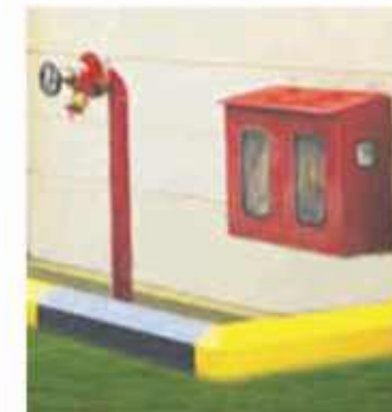
REFERENCE IMAGE FOR FIRE HYDRANT