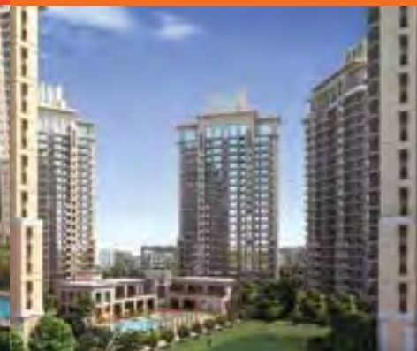
ATS KOCOON Gurgaon