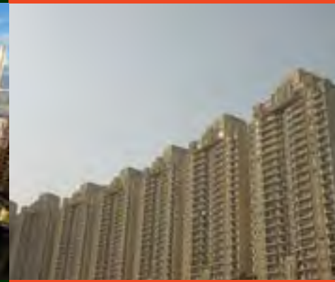
ATS ONE HAMLET Noida