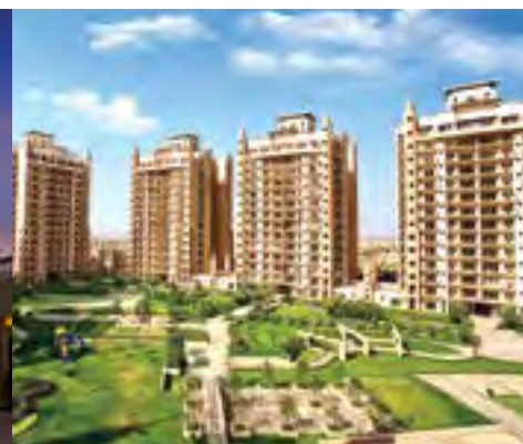
ATS PARADISO Greater Noida