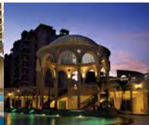
ATS VILLAGE Noida