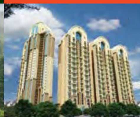
ATS DOLCE Greater Noida