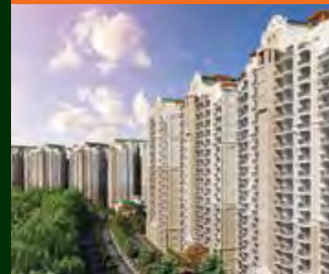
ATS LIFESTYLE PHASE II Dera Bassi