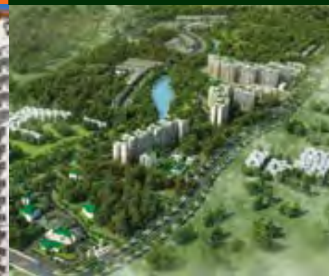
ATS GOLF MEADOWS Dera Bassi