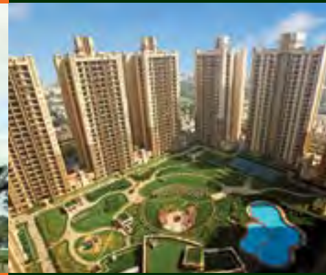
ATS ADVANTAGE PHASE I Indirapuram