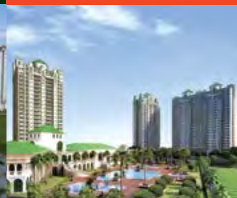
ATS PRISTINE Noida