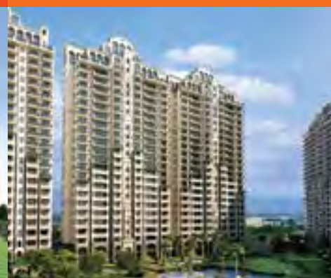
ATS CASA ESPAÑA Mohali