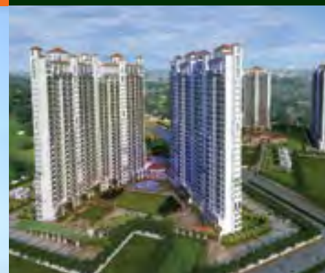
ATS TRIUMPH Gurgaon