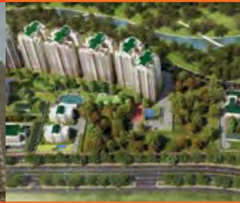
ATS LIFESTYLE PHASE I Dera Bassi