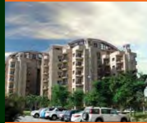
ATS PRELUDE Dera Bassi