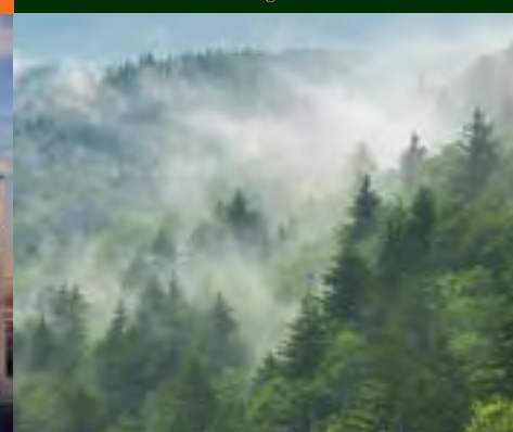
ATS HEAVENLY FOOTHILLS Dehradun