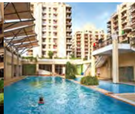
ATS GREENS II Noida