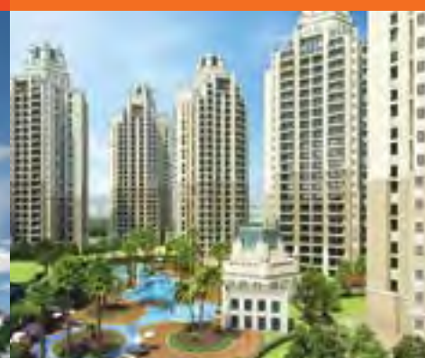
ATS ALLURE Yamuna Expressway