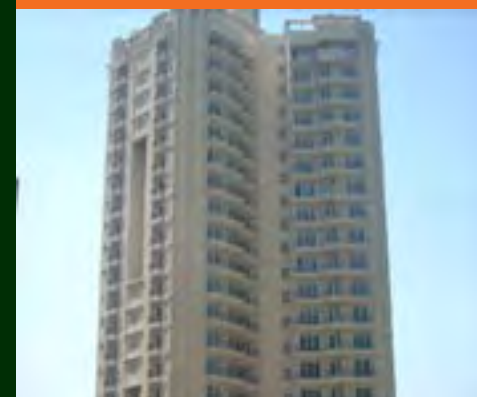
ATS HACIENDAS Indirapuram