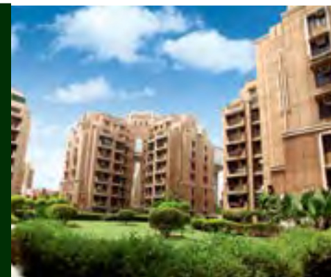
ATS GREENS I Noida