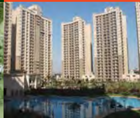
ATS ADVANTAGE PHASE II Indirapuram