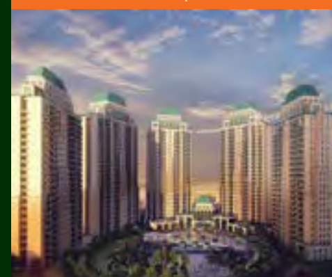
ATS TOURMALINE Gurgaon