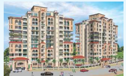
Rishabh Platinum - Indirapuram