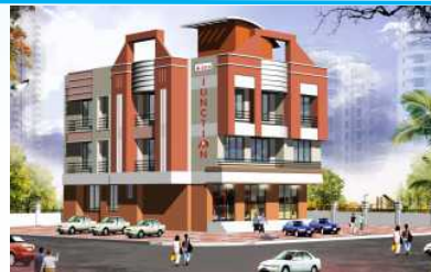
Aims Junction - Mumbai