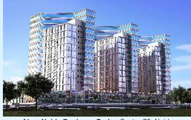
Aims Noida Business Park Sector-75, Noida