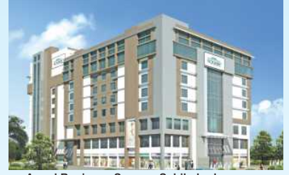
Angel Business Square - Sahibabad