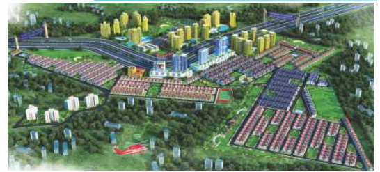
Aims Shanti City ( 133 Acres Township ) Sigora Hills, Gwalior