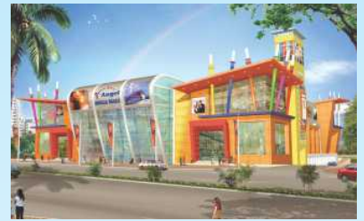
Angel Mega Mall - Kaushambi