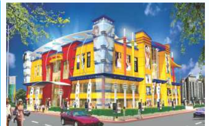
Angel Prime Mall - Panipat