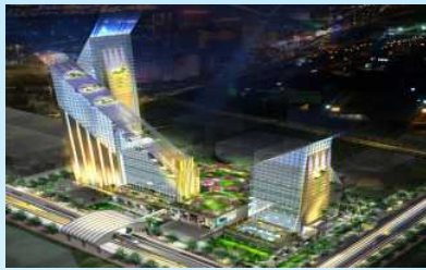
Aims Land Mark Towers Sector-15, Noida