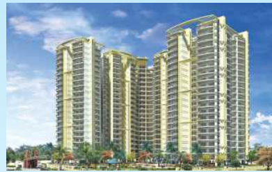
Angel Mercury - Indirapuram