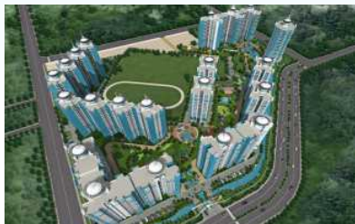
Aims Glory Sector- 46, Noida