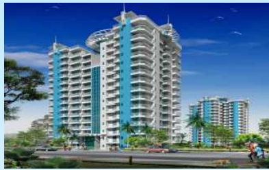
Aims Grace Sector-61, Noida