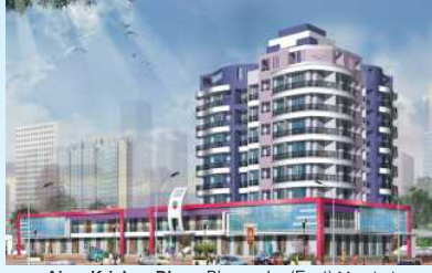
Aims Krishna Dham Bhayander (East), Mumbai