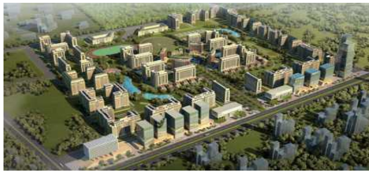
Aims Golf City (150 Acres Township) Sector-75, Noida