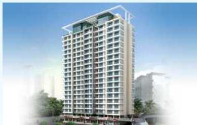
Aims Sea View Bhayander (East), Mumbai