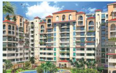
Rishabh Paradise - Indirapuram