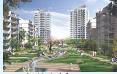
Angel Jupiter - Indirapuram