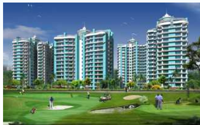
Aims Golf Avenue-1 Sector-75, Noida