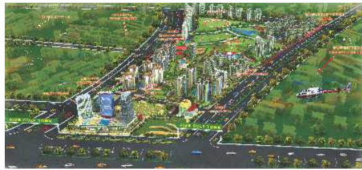
Aims Golf Town ( A 105 Acres Township ) Greater Noida West