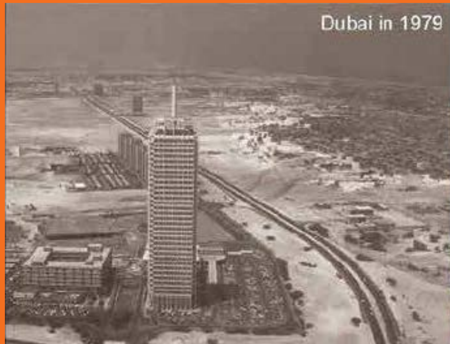
Dubai in 1979