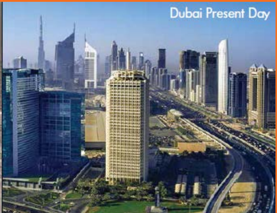
Dubai Present Day

The city's first landmark in 1979. The DWTC has acted as a platform for business growth.