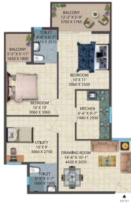
2 BHK + Utility - Typical Floor Plan