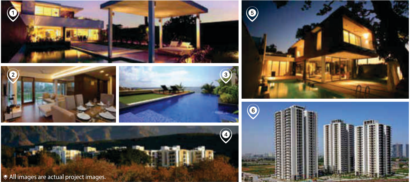
1. Infiniti Bay - Goa | 2. Calem Grove 3 - Goa | 3. Ocean Deck - Goa | 4. Arborea - Dehradun | 5. Calem Grove - Goa | 6. Heritage One - Sector 62, Gurugram