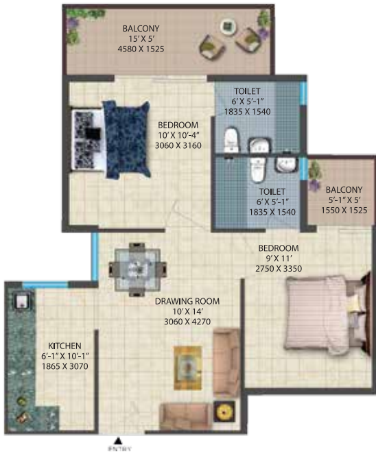
2 BHK - Typical Floor Plan