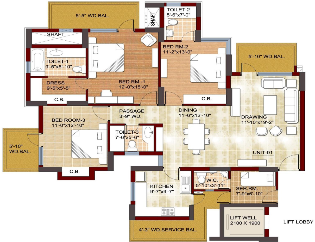
UNIT PLAN - Saleable Super Area 2194 Sq.ft. (4th to 15th Floor)